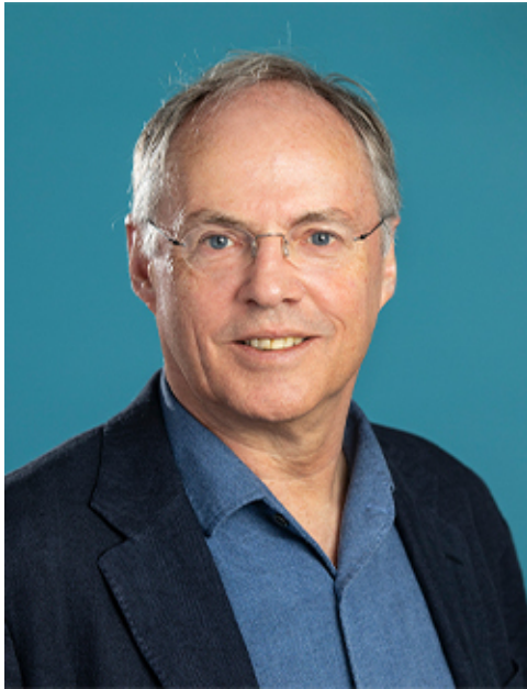
Hans Clevers, MD, PhD, the Hubrecht Institute for Developmental Biology, Organoids Technology