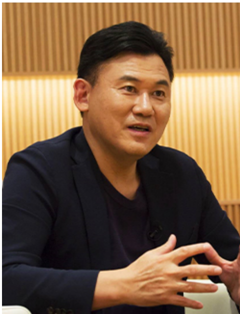
Hiroshi Mikitani, CEO of Rakuten Medical, Inc., Innovative Technology in Oncology